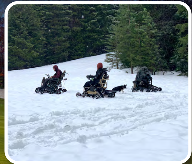
The annual David's Chair Snow Excursion is now in its fourth year, allowing participants the opportunity to experience the winter wonderland of Union Creek, Oregon.