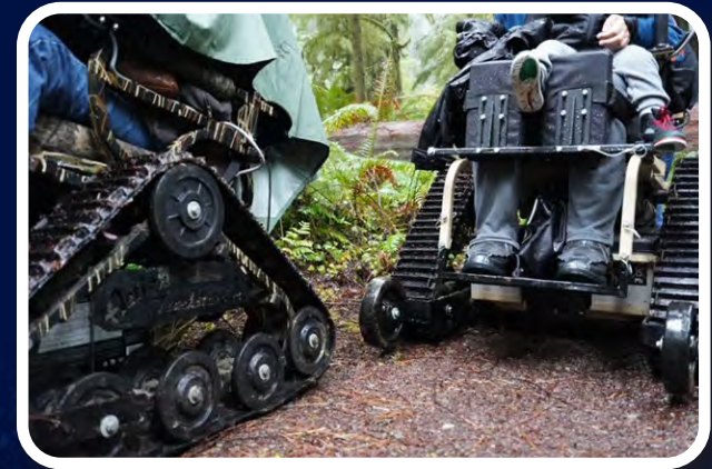
David's Chair track chairs allowed users to explore the redwoods in Northern California in 2019. Places like these aren't easily accessible to regular wheelchairs.