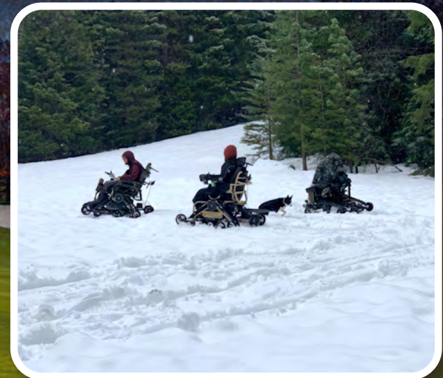
The annual David's Chair Snow Excursion is now in its fourth year, allowing participants the opportunity to experience the winter wonderland of Union Creek, Oregon.